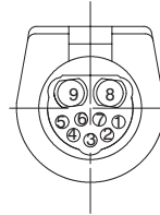
Receptacle Viewed from the Mating Side

Power contact in position 8 and 9 only. Signal contacts in positions 6 and 7 only.